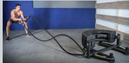
Functional attachments allow for Battle Rope and Resistance Band Training