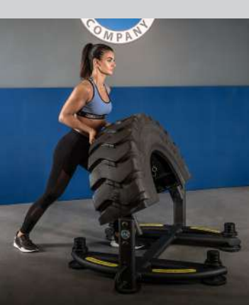
Flip & Step in