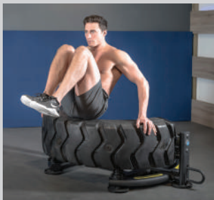
Strength Training: Ab Crunches, Dips and Pushups