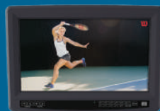
15.6 in / 39.6 cm Personal Viewing System (PVS)