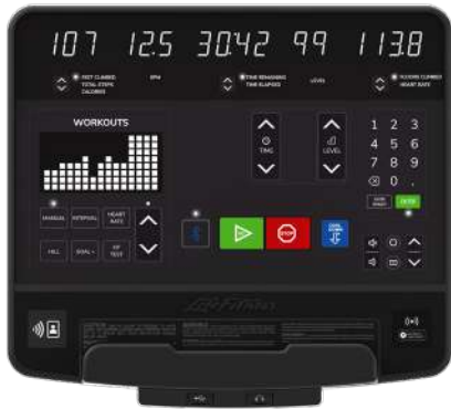
INTEGRITY SL CONSOLE

Console choices include simple, get-on-and-go functionality to more engaging options. Each offers wireless connectivity and insights through Halo.Fitness.