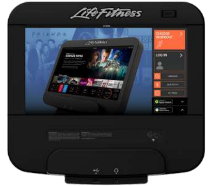
DISCOVER SE3 HD CONSOLE