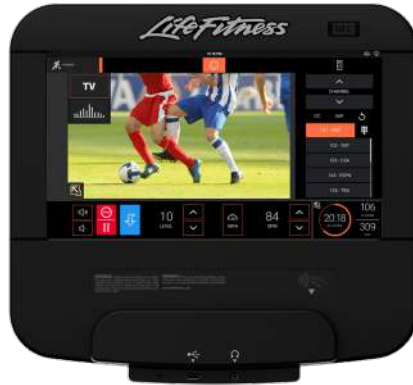
DISCOVER ST CONSOLE